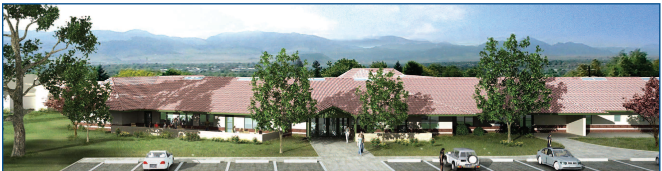
Architectural rendering of Wide Horizon renovations

We ask Christian Scientists throughout the Western States to please support our $3 million